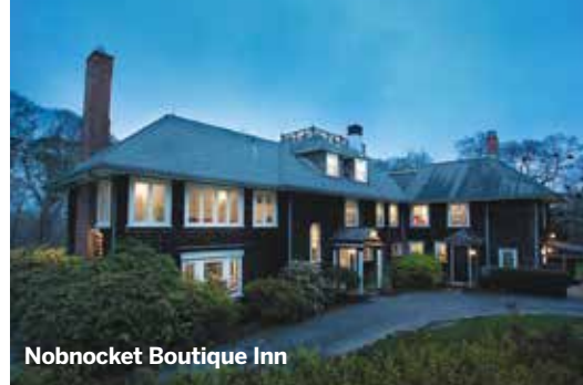
Nobnocket Boutique Inn

Old-world charm meets contemporary style at Nantucket's newest property on Broad Street, scheduled to open in late September. Greydon House , consisting of an 1850s Greek Revival structure and an addition, will offer 20 luxe rooms, restaurant and patio dining, and public spaces such as a living room with custom-built fireplace, low-slung vintage sofas, and marble-topped cocktail bar. The hotel is a 10-minute taxi ride from the airport and a five-minute walk from the ferry docks. 508-228-2468, greydonhouse.com