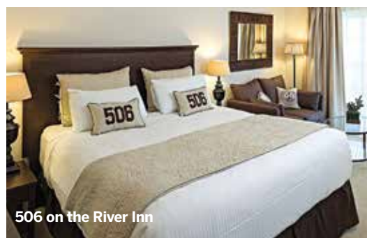
506 on the River Inn