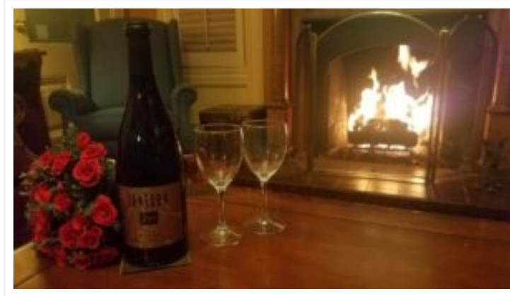
— Kaleidoscope Inn & Gardens in Nipomo CA.

Posted on February 8, 2018 by BnB Finder