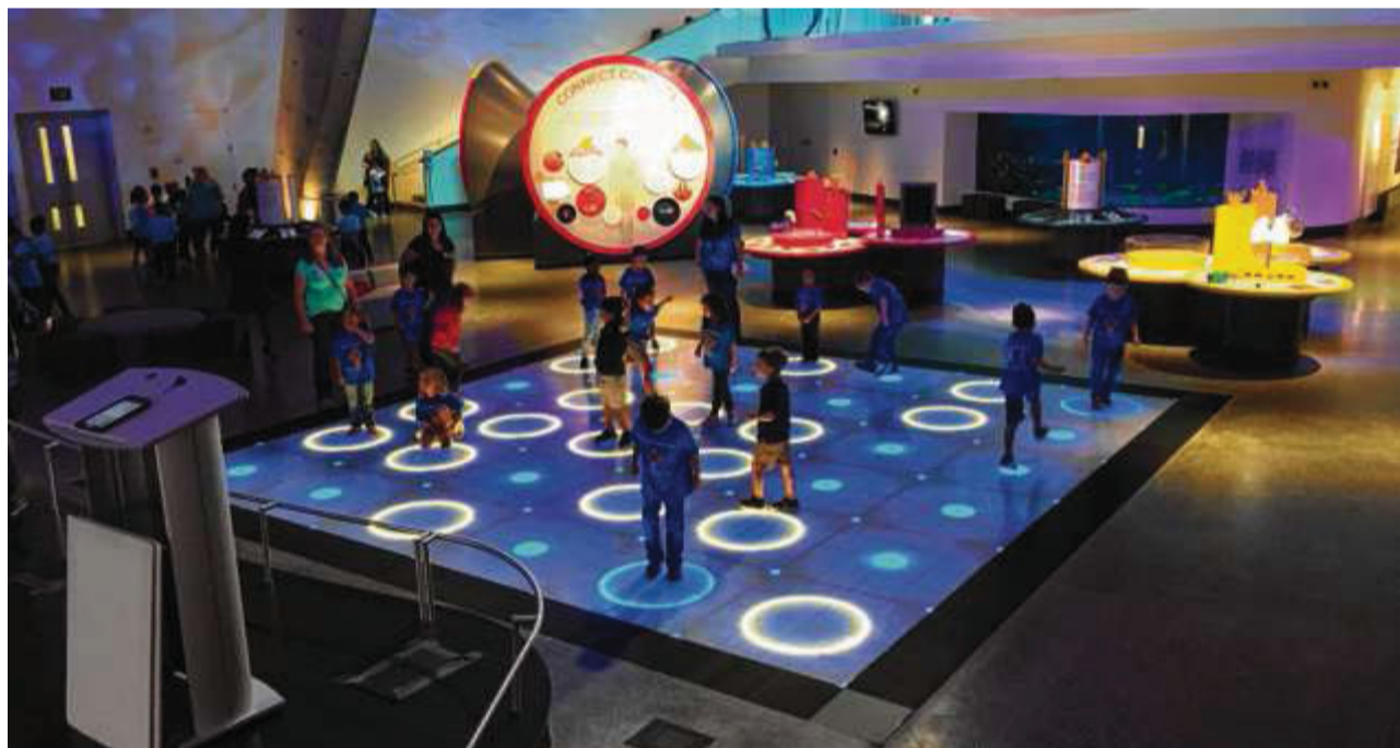
MeLab is a zone where kids can learn about science and health while playing, moving, and occasionally jumping about on an interactive sound-and-color-lighted floor.