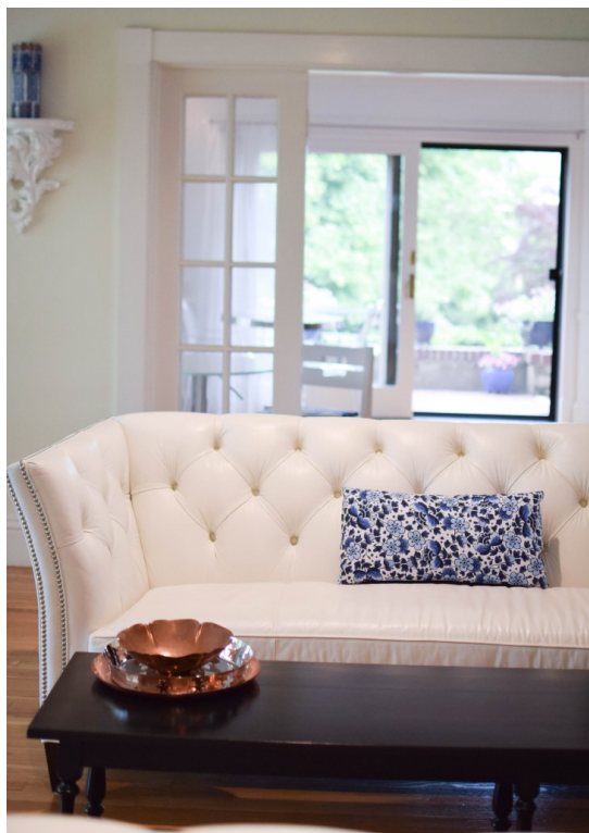
the charming downstairs of the inn