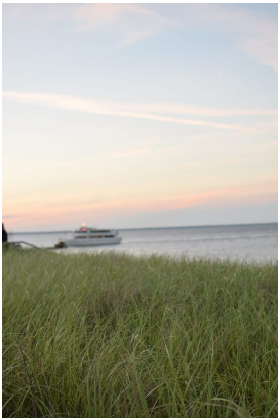
our view from our table at the Lookout Tavern