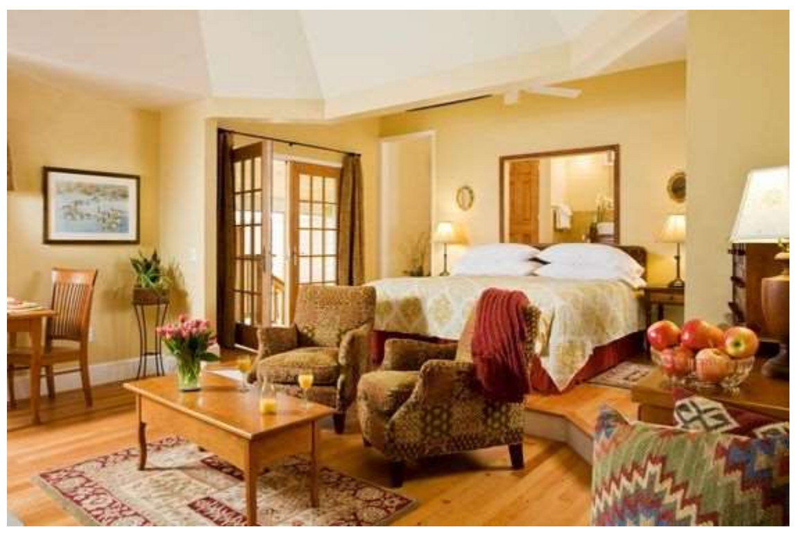
Brampton Bed & Breakfast Inn

If you're seeking a charming and intimate getaway, look no further than these exquisite bed-and-breakfast establishments scattered across the United States. From historic seaside retreats to modern boutique inns, each property offers a unique experience that promises to create lasting memories.