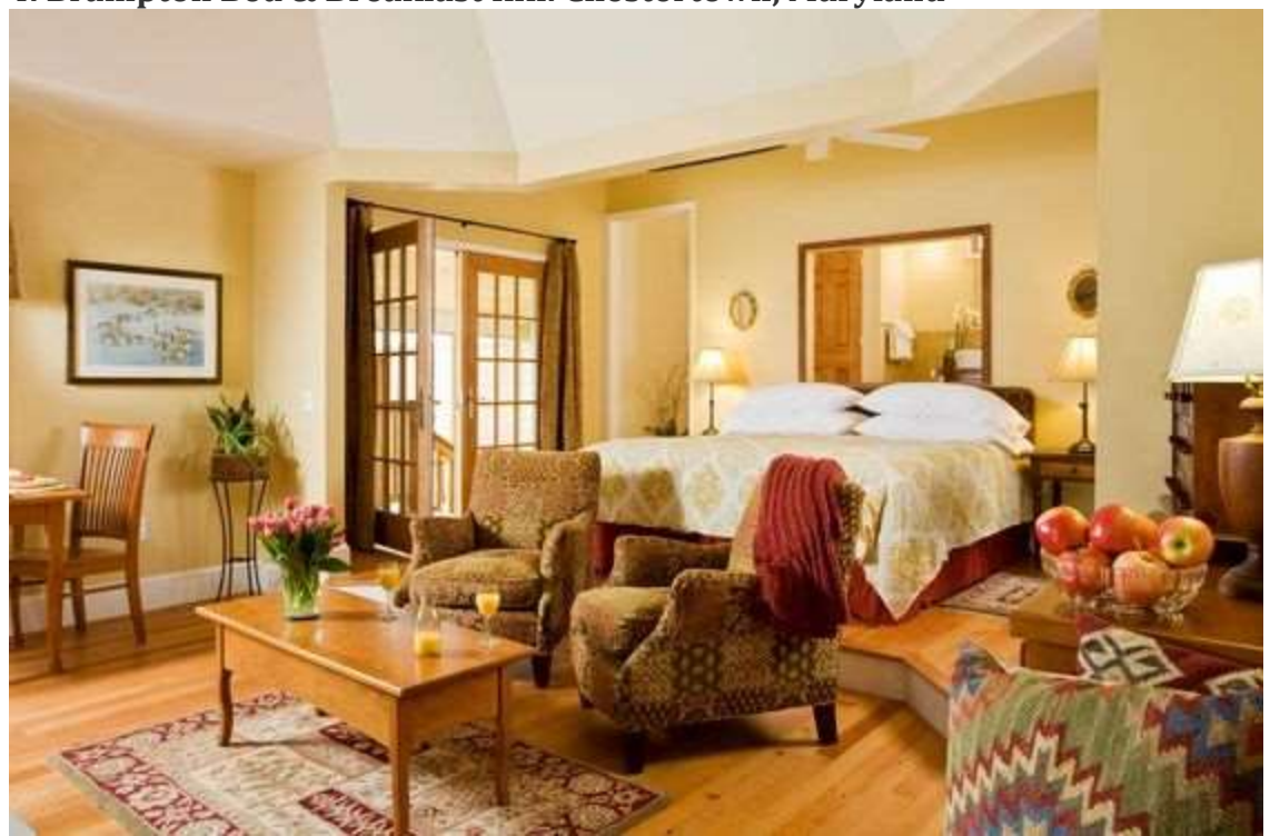
Brampton Bed & Breakfast Inn

4. Brampton Bed & Breakfast Inn: Chestertown, Maryland